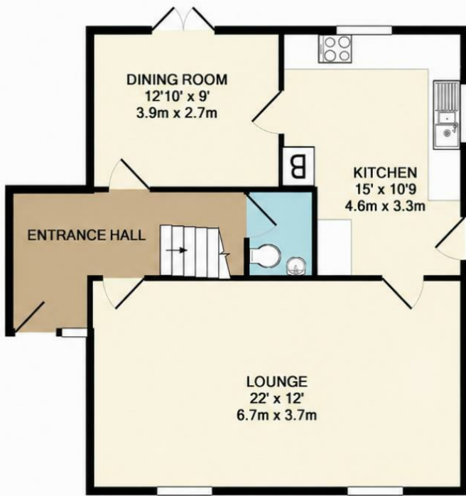
GROUND FLOOR APPROX. FLOOR AREA 611 SQ.FT. (56.8 SQ.M.)